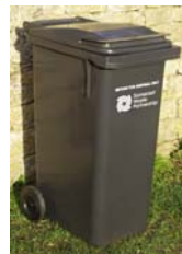
Wheeled bin for refuse (for suitable households)

SORT IT PLUS should double recycling rates and halve the amount of waste being sent to landfill sites.