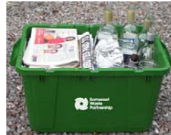
Recycling box for glass bottles and jars, paper and foil.