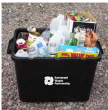
Recycling box for plastic bottles, cardboard and cans