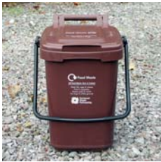
Food waste bin with a lockable lid and a small food waste "caddy" for the kitchen.